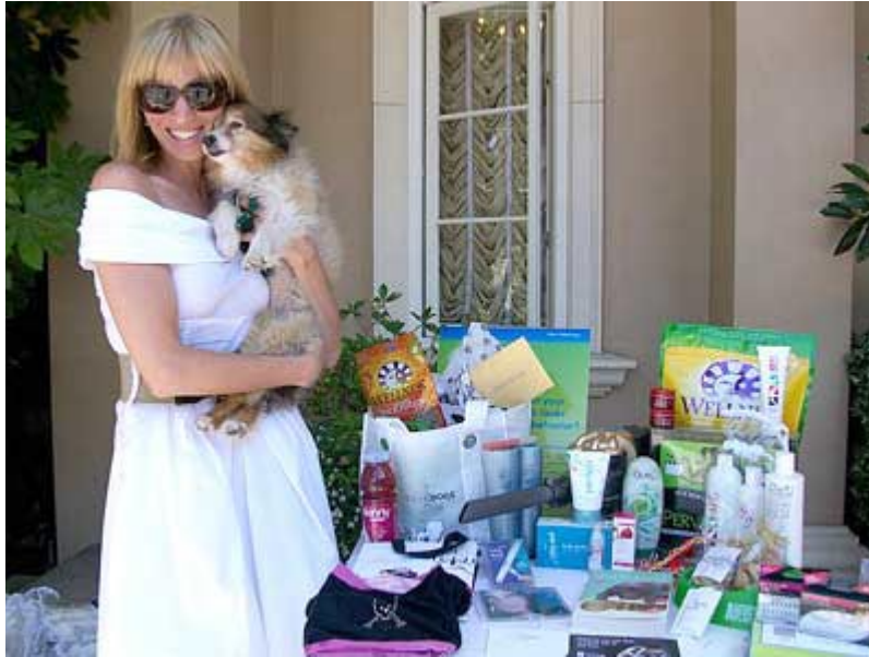
Singer/songwriter Deborah Gibson