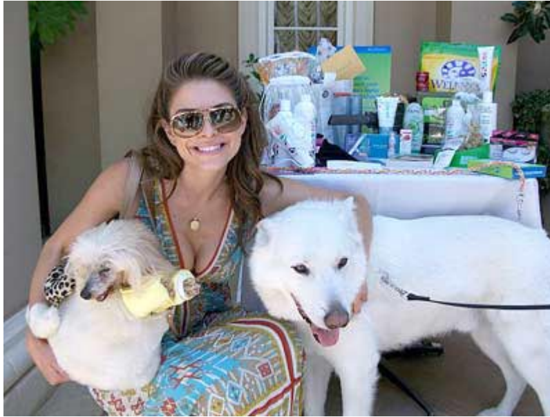
Maria Menounos from "Access Hollywood"