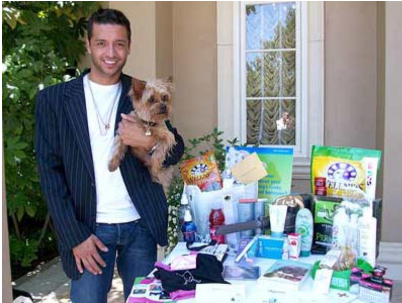
Jai Rodriguez from "Queer Eye" and "Groomer Has It"

To read a full review of “ The Dogs Next Door ” Hollywood celebrity benefit, click here .