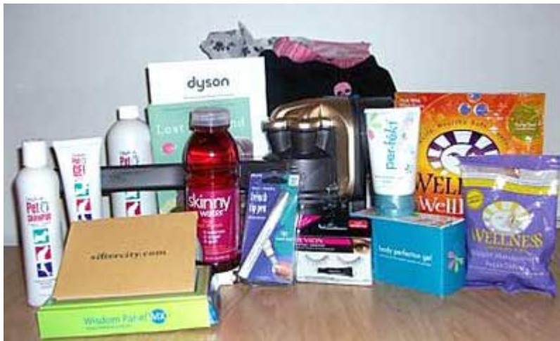
Some contents of the Dogs Next Door gift bags

Wellness Pet Food – organic all natural pet treats to help a dog maintain a happy and healthy life. Their slogan is LIVE WELL, EAT WELL, BE WELL.